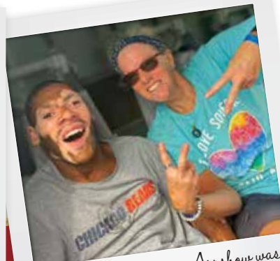
The NW Illinois Airshow was a blast for a big group of us!